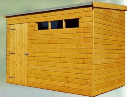
Reversed Pent Sheds