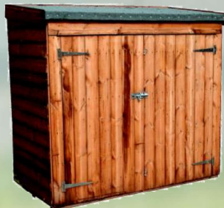
Tool cupboard Sheds