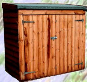
Tool cupboard Sheds