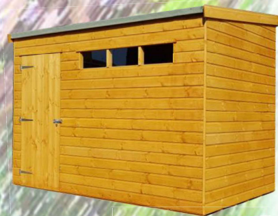
Reversed Pent Sheds